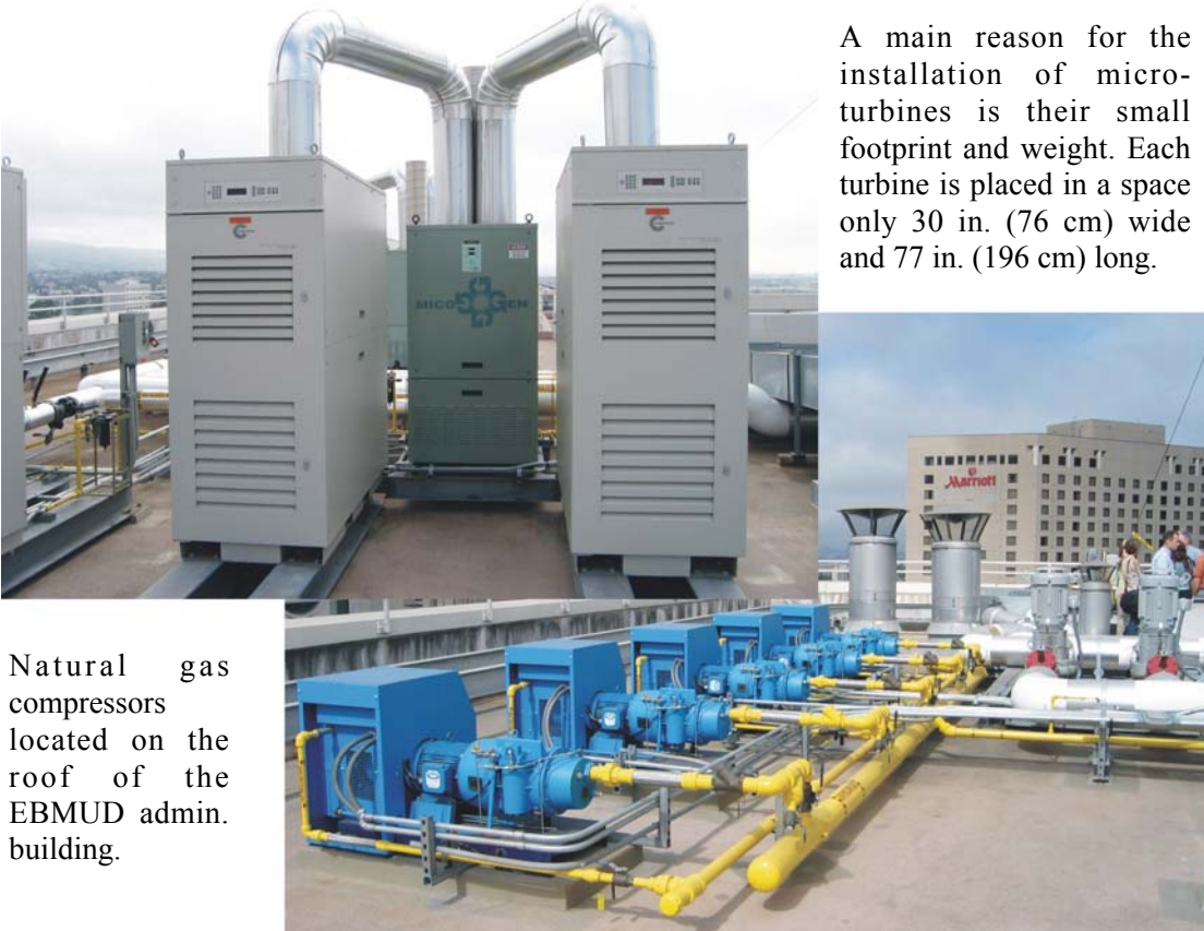
Natural gas compressors located on the roof of the EBMUD admin. building.

A main reason for the installation of micro-turbines is their small footprint and weight. Each turbine is placed in a space only 30 in. (76 cm) wide and 77 in. (196 cm) long.